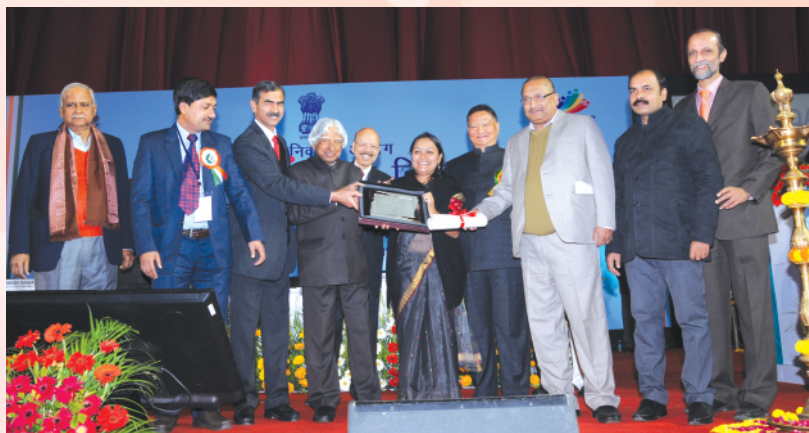
CEO, PECUC & Coordinator , OEW receiving National CSO Award

decision making process, building capacity of key stake holders, and advocating for electoral and political reforms. Hence, PECUC has undertaken various activities including voter awareness, enrolment of new young voters, deletion of double voter Id cards, debates and discussion for electoral reform, policy analysis,