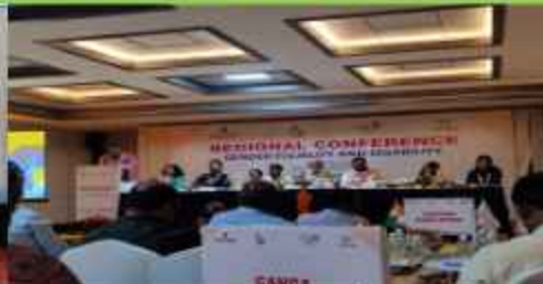
Secretary PECUC addressed at G-20-C20 Regional Conference on Gender Equality and Disability at Ranchi on 26 th May 2023