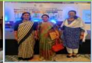
Executive director participated in Consultative Workshop on Developing District SDG Indicator Framework-Odisha