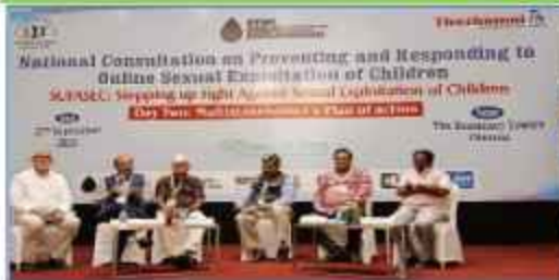
Secretary PECUC participated in National Consultation on Preventing and Responding to Online Sexual Exploitation of Children organized at Chennai on 27 th Sept 2023 by Children of India Foundation