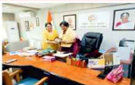
ED, PECUC attended Beijing 30- 2days National Consultation of CSOs organized by National Commission of Women at New Delhi