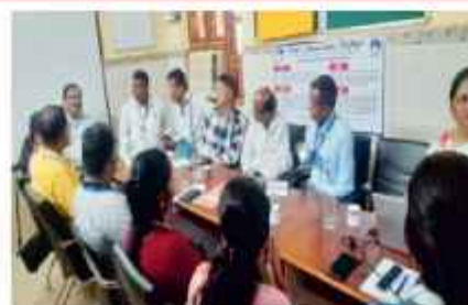
Exposure visit of PCEMD organisation team, Bihar to PECUC's Coordination office