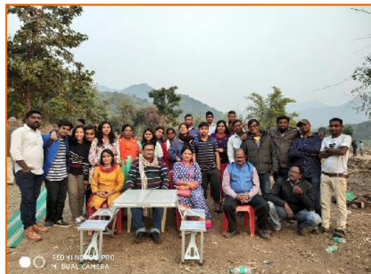
PECUC Team at Deojhar, Cuttack

Even they are also gradually showing the same at the home as for their guardian's remarks. Self care like-bathing, grooming, dressing, feeding, leisure activities (Playing Games). Through demonstration and practical exercises teaching children are aware about self care and using different game materials like Flash Cards, Puzzles, Padge Board improves communication skills; improves receptive and expressive languages skills; Improves speech articulation and Improves vocabulary.