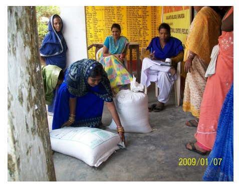
Humanitarian Need and requirement for Restoration of Normal condition / Rehabilitation